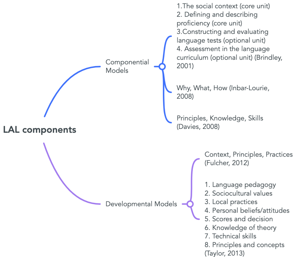
Figure 1 LAL Models and Components

in great detail, which might result in confusion as to what precisely each component entails. For instance, the "scores and decisions" component overlaps with "language pedagogy" since formative assessment can include both decision-making and pedagogy. As another example, the two components of "knowledge of theory" and "principles and concepts" overlap since both theory and concepts can refer to the same notion. While Taylor's model has been used in different studies (e.g., Baker & Riches, 2018; Bøhn and Tzagari, 2021; Yan et al., 2018), the only empirical study which has attempted to operationalize this model is that of Kremmel and Harding (2019). In their study, the results of Exploratory Factor Analysis show a nine-factor model. Figure 1 outlines a diagrammatic sketch of the components of LAL in the models discussed in this section.